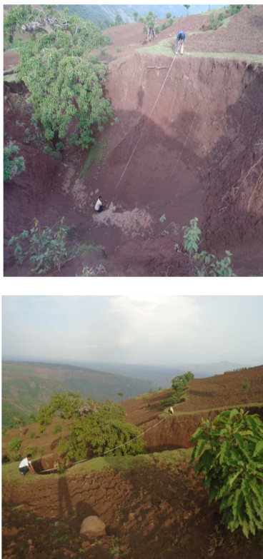
Figure 3. Soil erosion and land degradation under Koka-Lewate watershed (Source; field survey, 2017).

Farmers manage soil erosion problems using both physical and biological conservation measures. Tree plantation, plantation of banana and desho grass, contour plowing, soil bund, stone bund, fanya juu terrace, and cutoff drain are common in the area. Experts revealed that the use of biological conservation measures is very limited in type and area coverage. In general, lack of adequate and effective soil and water conservation measures coupled with poor management of the existing conservation measures have led the problem of soil erosion to continue.