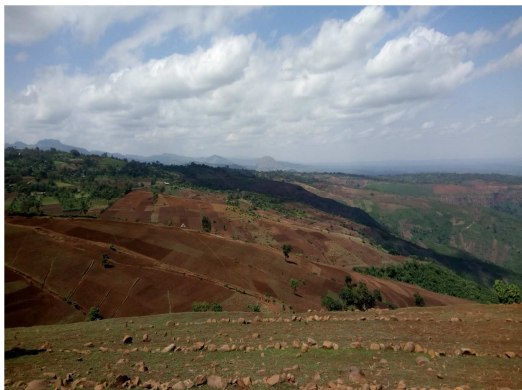
Figure 2. Dominant land use type of the study area.

The study result revealed the watershed is intensively cultivated. From the total catchment area, the proportion of land use of respondents is about 34.36, 4.89, 0.77, and 3.18 ha cultivated, grazing, outcrop, and woodland respectively. The study indicated, there is land shortage per HH and most farmers under study area engaged in converting forest and fragile lands to cultivated land particularly at downstream of the catchment. All respondents dictated the study area has a history of a dense forest; however, due to deforestation and agricultural land expansion, it is seriously devastating. The result shows, deforestation, intensive cultivation, and agricultural expansion to fragile lands are the main factor contributing to accelerated soil erosion, land degradation, migration of wild animals, a hindrance to production and productivity.